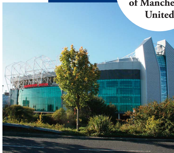
Old Trafford Football Club

Gala Dinner and entertainment at the home of Manchester United